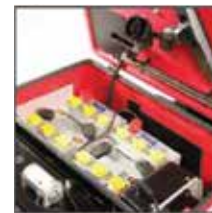
4 x BATTERIES 6V-180AH (20h)