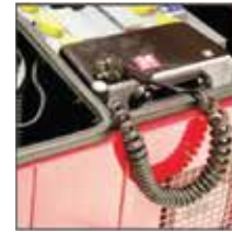
ON-BOARD BATTERY CHARGER