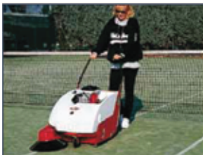
KIT ACE: SPECIAL VERSION FOR THE MAINTENANCE OF SYNTHETIC GRASS FIELDS