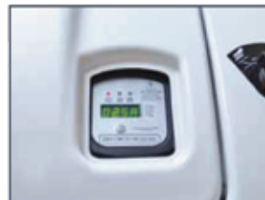
ON-BOARD BATTERY CHARGER