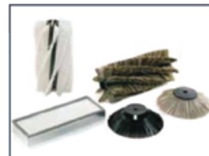
BRUSHES AND FILTERS